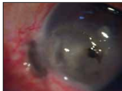
Corneal stromal infiltration and necrotic scleral lesion covered with black pigment